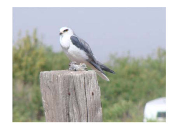
WHITE - TAILED KITE

Other rare species seen during the count were; Zone-tailed Hawk, Virginia Rail, Least Flycatcher, Blue-headed Vireo, Lucy's Warbler, and Goldencrowned Sparrow.