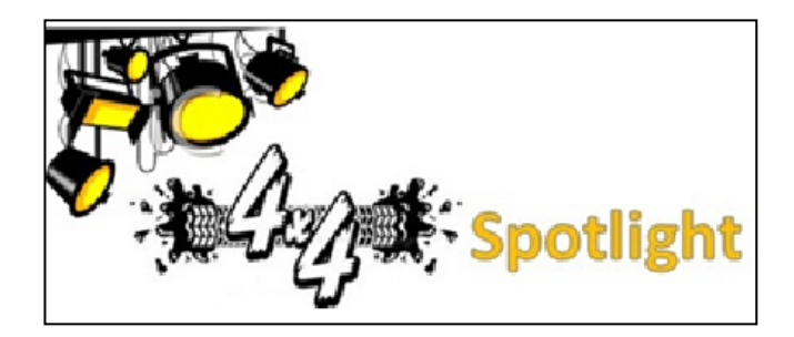
How and when did you acquire your rig? Bought 7 years ago from a friend at work.