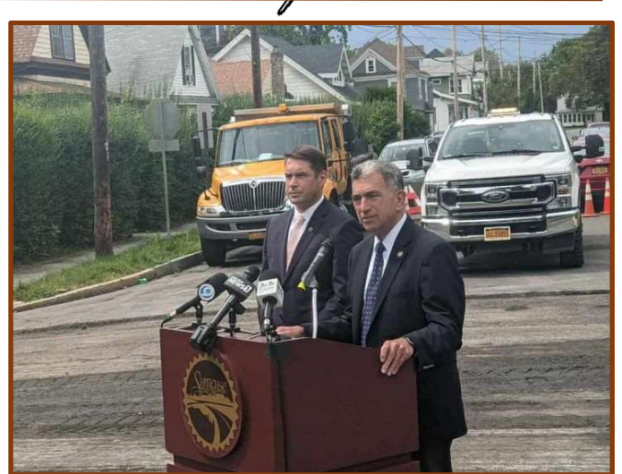
Syracuse Mayor Ben Walsh and Assemblyman Magnarelli announce $7.25 million in New York State Touring Routes Funding for the city of Syracuse.

The State Legislature authorized $100 million in Touring Routes funds in the state's 2021-22 budget to go to municipalities to enhance the physical condition of roadways, create jobs and enhance local economic competitiveness. The City of Syracuse received $7.25 million in New York State Touring Routes funding.