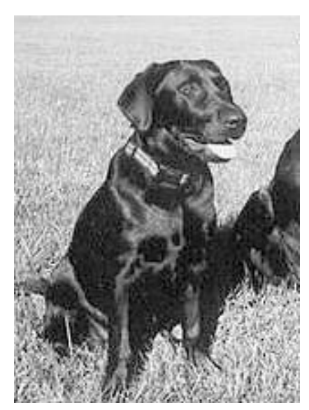
Jerryru's Acceptable Risk (Legend), CGC. FMCh (May 1, 2001 - April 16, 2007)