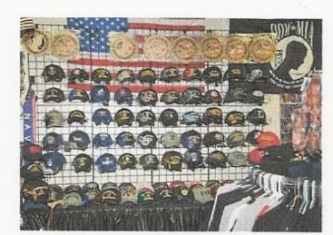
Ft Harrison Bunker Store