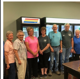
Volunteers are pictured with the new refrigerator.

Earl Bane Foundation Makes Gift to EAFB- In early August EAFB was notified by the trustees of the Salina based Earl Bane Foundation that we had been granted funds to purchase some new equipment for our food distribution program. Thanks to their gift we were able to purchase a new industrial refrigerator for our pantry and new carts and other equipment to move product from the warehouse to the distribution area. The new equipment has allowed us to make significant improvements in our distribution processes. We can move bulky product easily and the refrigerator keeps dairy products cold right up to the time they are sent out the door with our clients.