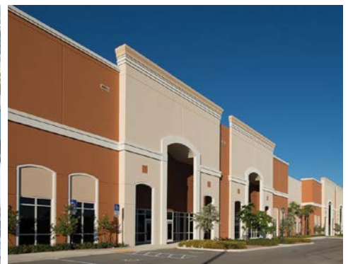
Bridge Point Miramar 15501 SW 29th Street Miramar, Florida 304,428 SF for Lease