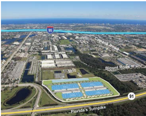
Rock Lake Business Center 3100 - 3250 NW 33rd Street Pompano Beach, Florida 494,425 SF for Lease