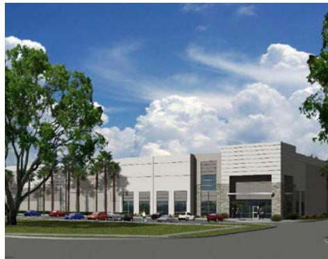
Palm Beach Park of Commerce Beeline Hwy. & Pratt Whitney Jupiter, Florida 220,000 SF for Lease