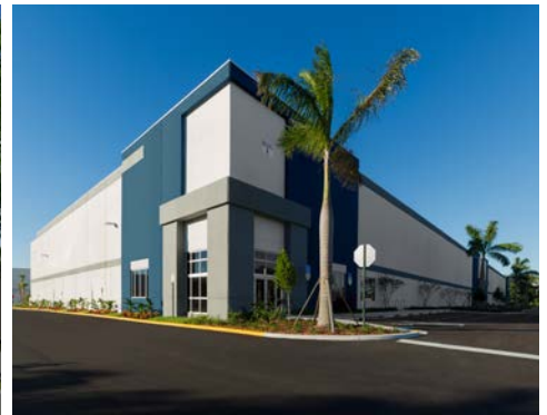
I-95 Business Center 3500 SW 30th Avenue Dania Beach, Florida 165,010 SF for Lease