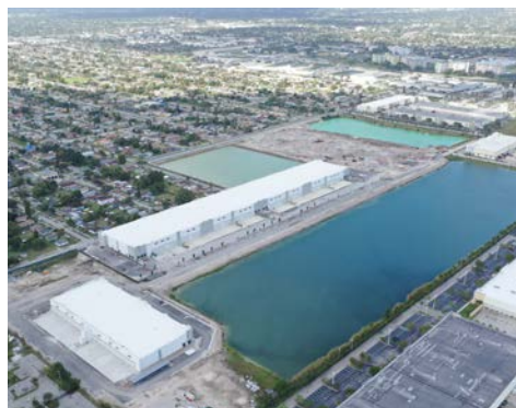
Seneca Commerce Center SW 38th Avenue Pembroke Pines, Florida Up to 585,242 SF for Lease