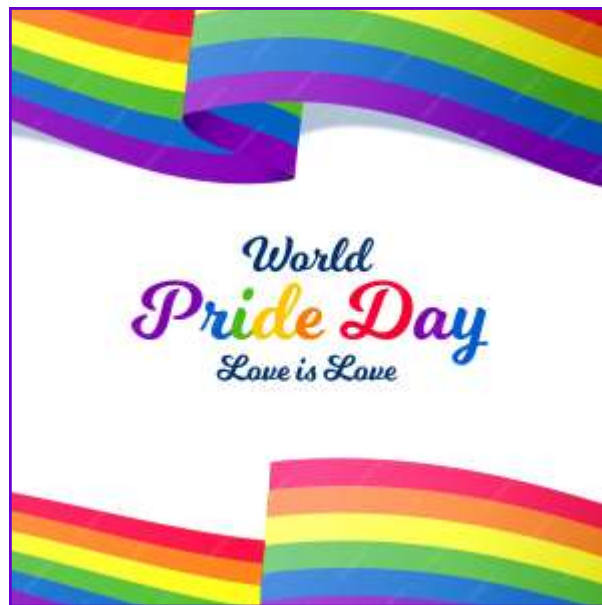
PRIDE DAY 2024