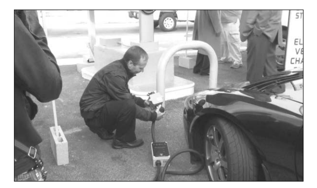
Step two: Connect adapter to Tesla charging plug

The station is located at the South Port Plaza, Liberty Service Station, 1600 South. Christopher Columbus Boulevard, Philadelphia, PA at Tasker Street.