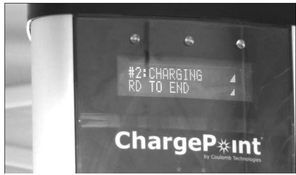
Step five: Read charging meter to see if the charge is taking