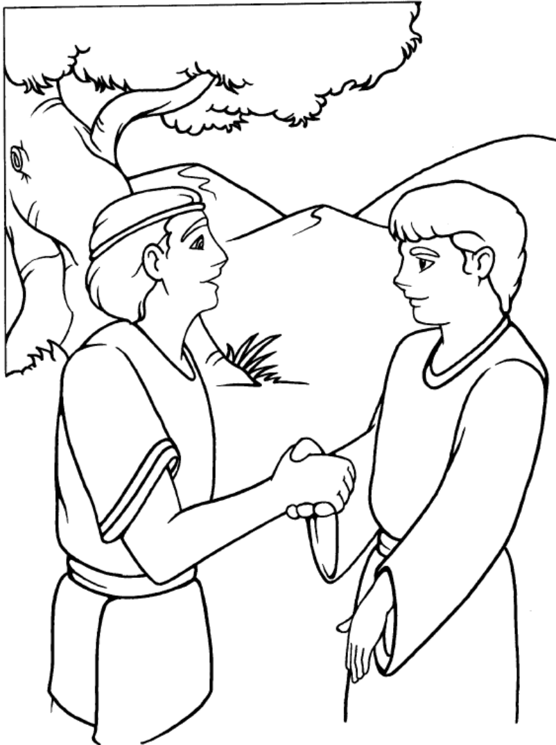
Esau Sells His Birthright to Jacob Genesis 25:19-34