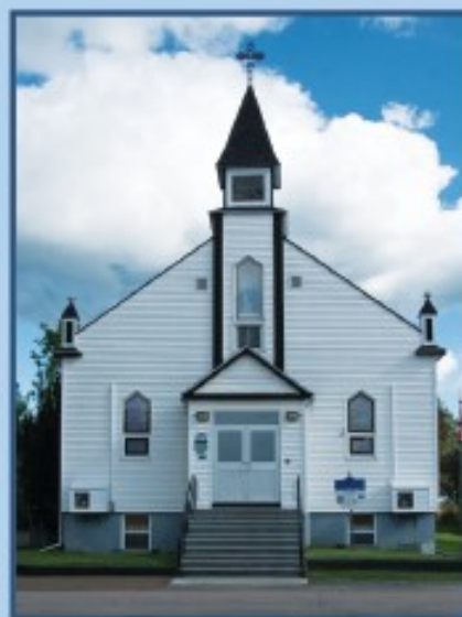
Our Lady of Mercy Pointe-du-Chêne