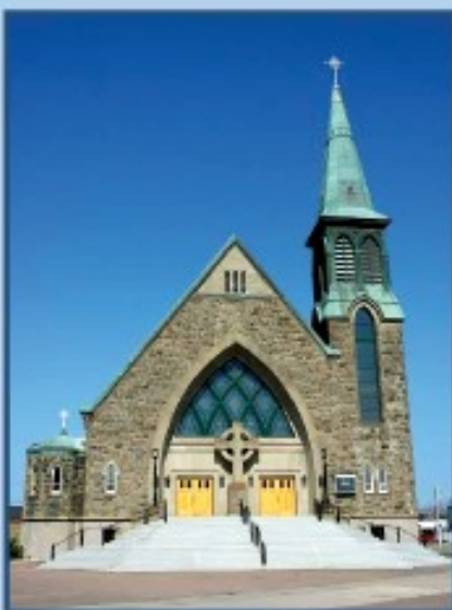
Saint Augustine's Moncton