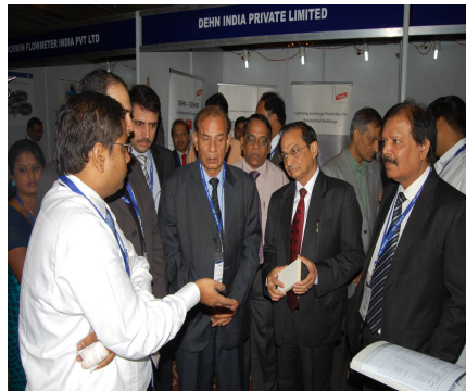
PNID 2012 at Hotel Taj Palace on 5 th October 2012