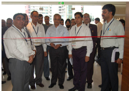
POWAT 2010 at Hotel Sheraton on 28-29 May 2010