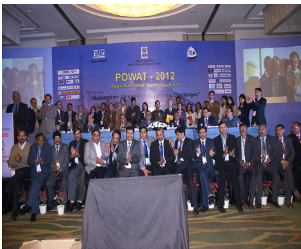
POWAT 2012 at Hotel The Grand on 13-14 Jan 2012