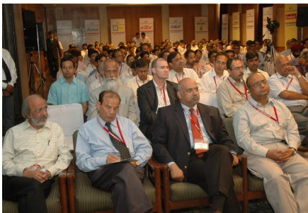
POWAT 2009 at Habitate world on 24-25 April 2009

International Society of Automation (ISA) is a world leader defining instrumentation and control standards, technologies and procedures that can identify and improve the process automation demands of industrial environments. It is conducting many conferences on Automation Technology for various industry segments by bringing together the Regulatory Organizations, Testing Labs, Technology Providers, Consultants, Manufacturers and End Users . The objective of these conferences is to discuss various aspects of Applicable Standards, Product Design, System Design and Solutions, Life Cycle Management (Operation & Maintenance) . Some of the past events are here under.