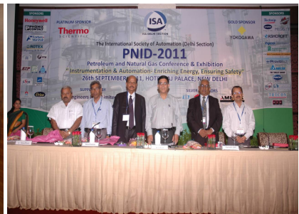
PNID 2011 at Hotel Taj Palace on 26 th September 2011