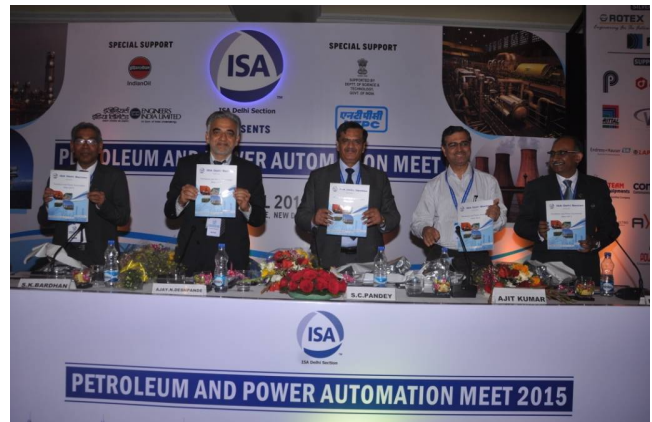
PPA MEET 2015 at Eros Hotel on 10-11 April 2015