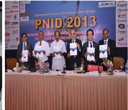
PNID 2013 at Hotel Taj Palace on 3 rd October 2013