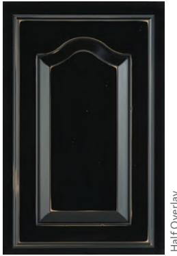
Carriage Black Ebony Glaze with Heirloom Distressing on maple