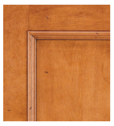
ANTIQUE Hand dents, round over