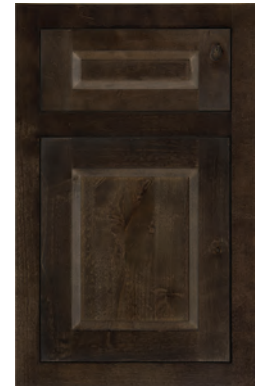
A | 6 C | 6 M | 5