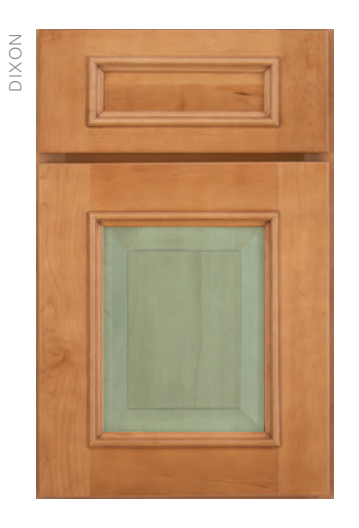
See Section 200 of your Iconic Specifications Manual for additional details.