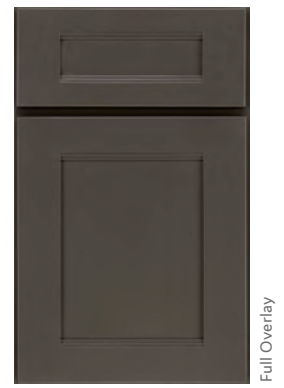
Earl Grey Classic