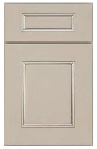
(ICONIC) Rochelle Flat Panel in Macchiato Ebony Highlight on MDF