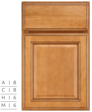
Sandalwood Burnt Sienna Highlight on maple