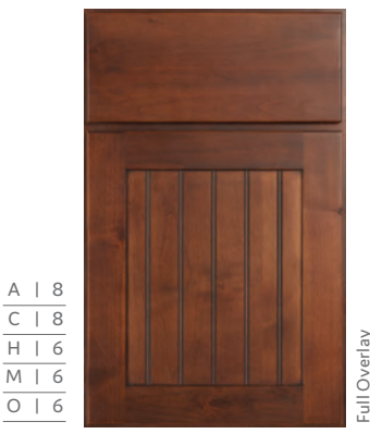
Amaretto Ebony Highlight on knotty alder