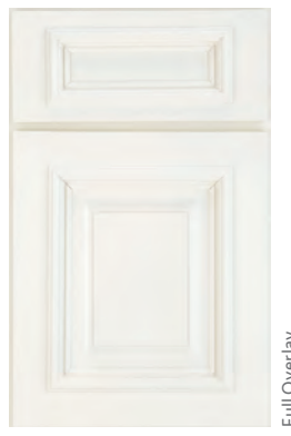
White Icing Classic