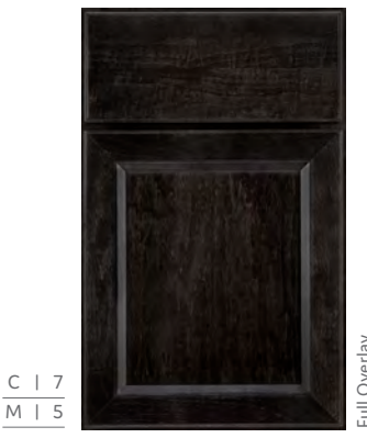
Onyx on maple