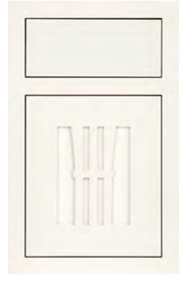
A | 2 C | 2 M | 1 D | 1 Q | 1