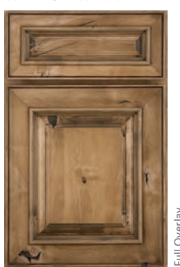
Cappuccino on knotty alder