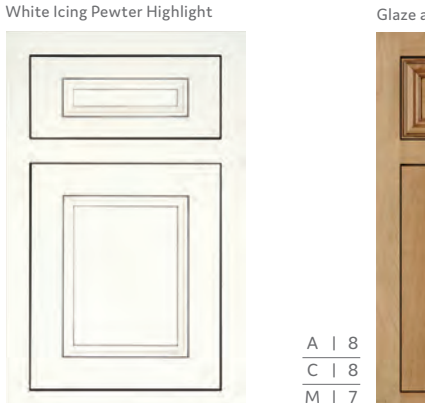
M | 7