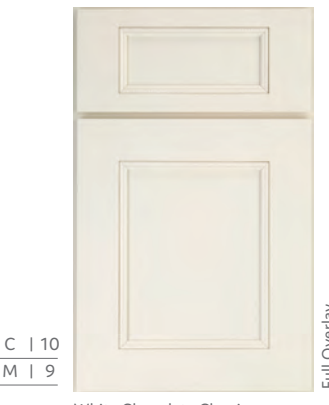
White Chocolate Classic