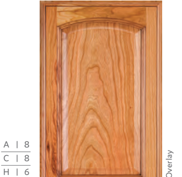
M | 6 Natural Burnt Sienna Highlight on cherry