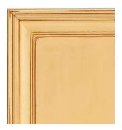
HEIRLOOM Machine dents, sand through