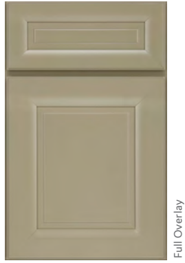
Bay Leaf Classic