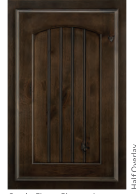
Smoke Ebony Glaze and Highlight on knotty alder