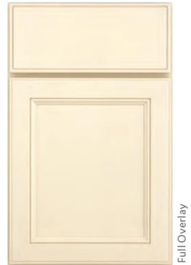
White Chocolate Classic