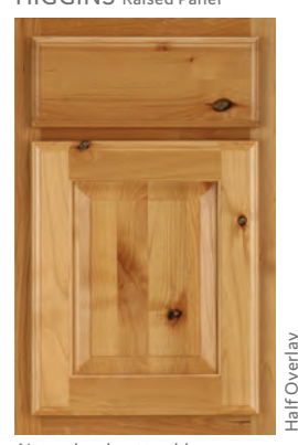
Natural on knotty alder