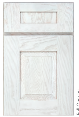
Cottage White Sheer on oak