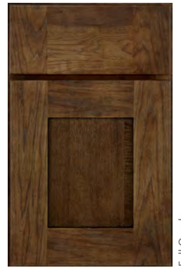
French Roast Sable Highlight on hickory