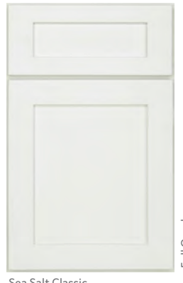
Sea Salt Classic