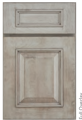
Peppercorn on cherry