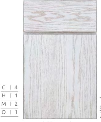
Cottage White on oak