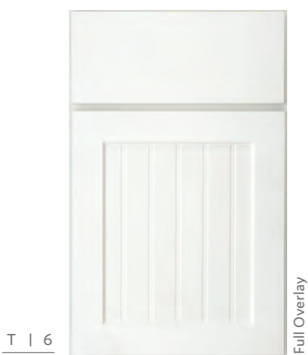
White on thermofoil