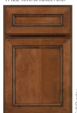
Amaretto Ebony Glaze and Highlight on maple