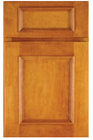
(Iconic) Dixon Flat Panel in Hazelnut on maple