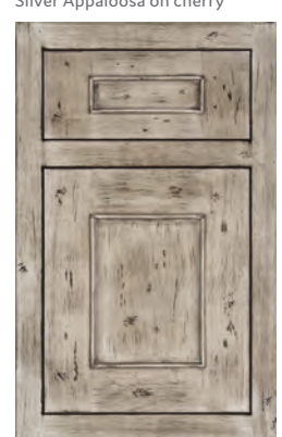
LOGAN Silver Appaloosa on cherry