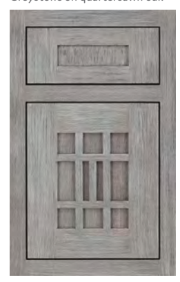
ROCKWELL Greystone on quartersawn oak