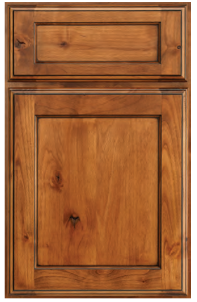
(Iconic) Crowley Reverse Raised Panel in Chestnut Ebony Highlight on knotty alder