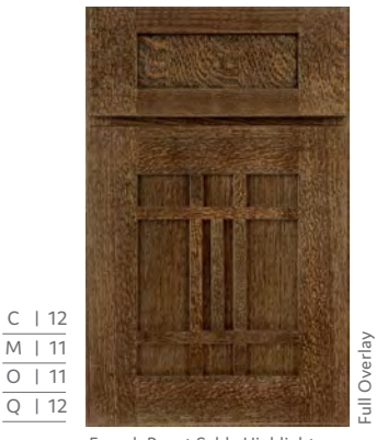
French Roast Sable Highlight on quartersawn oak