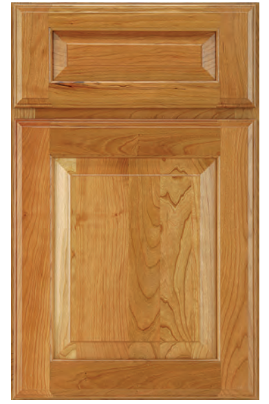
(Iconic) Crowley Raised Panel in Natural on cherry