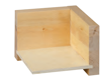
Fully captured drawer bottom

NOTE: Wood character and color variations are visible in hardwood.