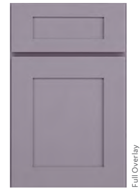
Dried Lavender Classic