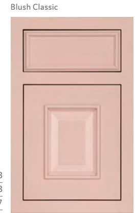
C | 8 M | 7