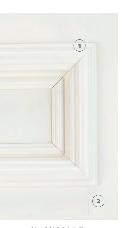
CLASSIC PAINT CHARACTERISTICS