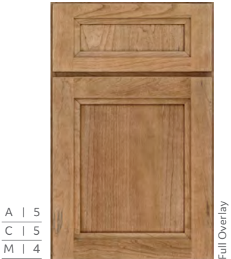
Cappuccino on cherry