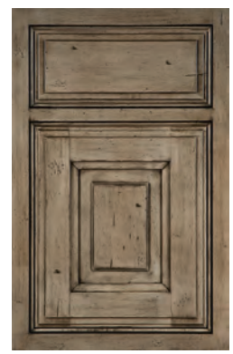
A | 2 C | 2 M | 1 D | 1