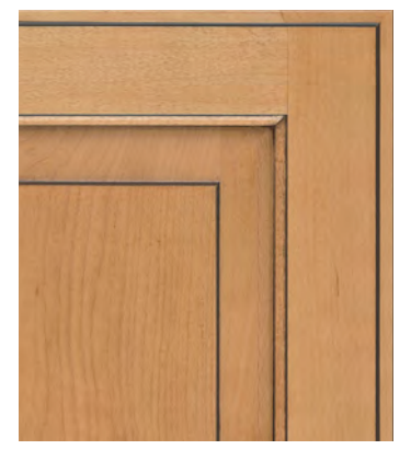
GLAZE AND HIGHLIGHT