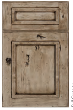
Peppered Appaloosa on knotty alder