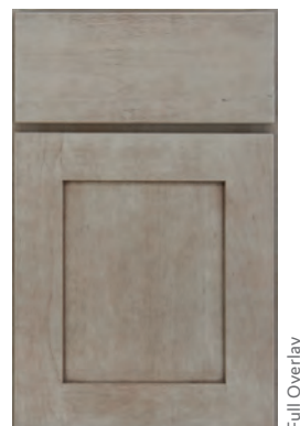
Peppercorn on cherry