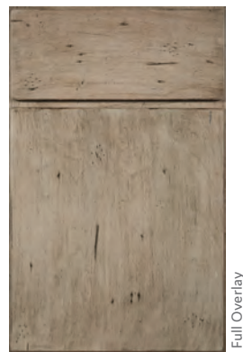
Peppered Appaloosa on cherry