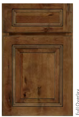
Eagle Rock Sable Glaze and Highlight on knotty alder