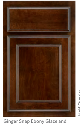
Highlight on maple