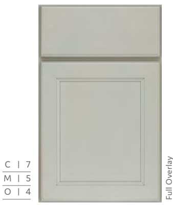
Castle Rock Sheer on oak