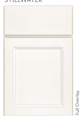
Sea Salt Classic