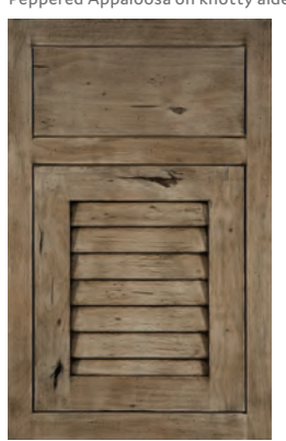
MONTEGO Peppered Appaloosa on knotty alder