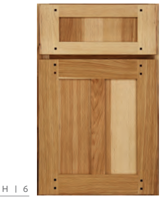
Tumbleweed on hickory