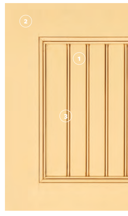
PAINT WITH GLAZE AND HIGHLIGHT CHARACTERISTICS

① Glaze hang-up ② Patina on flat surfaces ③ Highlight