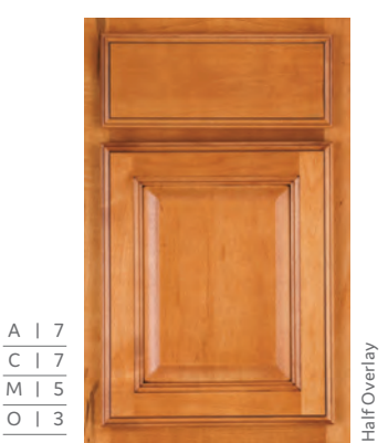
Hazelnut Burnt Sienna Highlight on maple