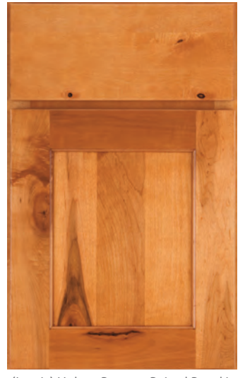
(Iconic) Holton Reverse Raised Panel in Hazelnut on rustic maple