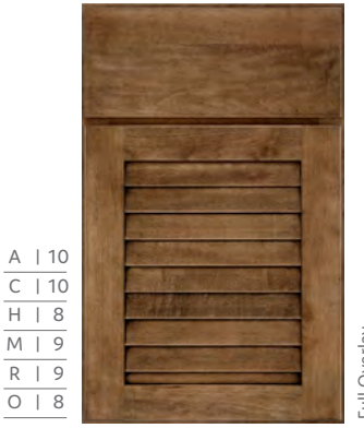
Eagle Rock Sable Glaze and Highlight on maple