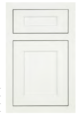
A | 7 C | 7 M | 6