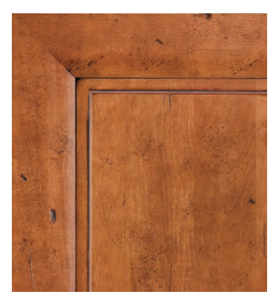
LEGACY Antique plus rasping, worm holes, chisel marks, knife splits, and cowtailing