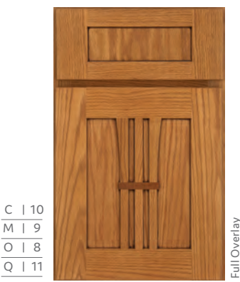
Sandalwood Burnt Sienna Glaze and Highlight on oak