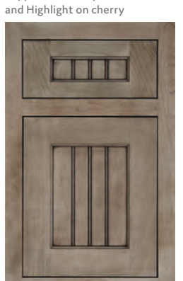
A | 8