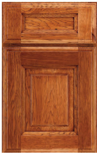
(Iconic) Colby Raised Panel in Pecan on hickory