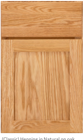
(Classic) Henning in Natural on oak