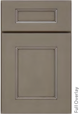
Frappe Ebony Highlight