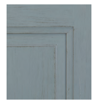
Light dry-brushed taupe accents available on any base color.