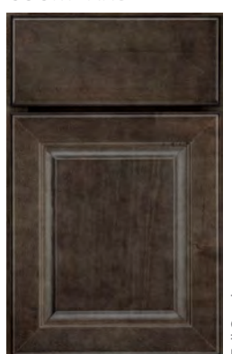
Smoke on maple