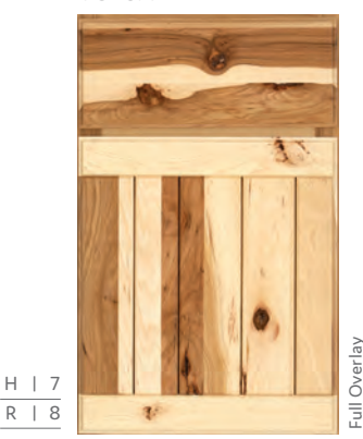
Natural on hickory