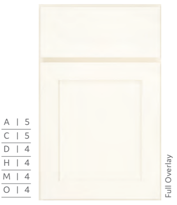
White Icing Classic