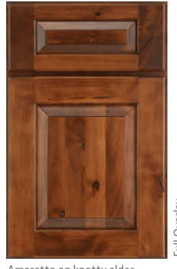
Amaretto on knotty alder