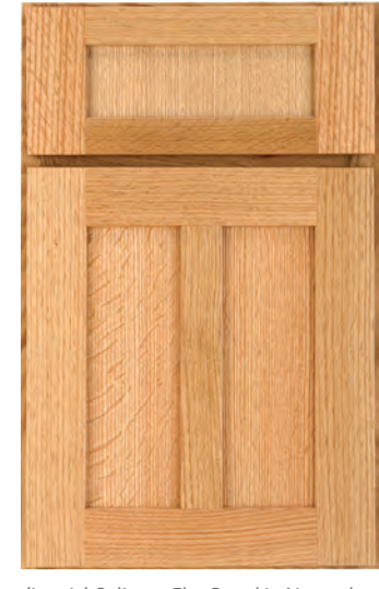
(Iconic) Salinger Flat Panel in Natural on quartersawn oak