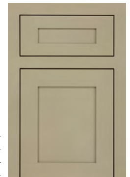
Eucalyptus Classic A | 8 C | 8