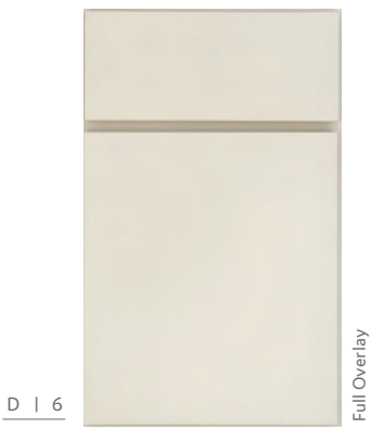
Irish Créme Classic