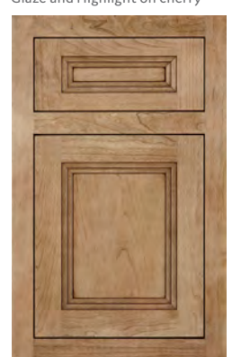
MORRIS Cappuccino Burnt Sienna Glaze and Highlight on cherry