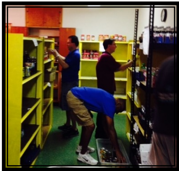
Rotary Club volunteering in the Food Pantry

If you would like to do something to make our community stronger, come and spend a little time in the food pantry! We need help stocking the store (T,W,F,S from 8:30am-noon), and processing pallets of food (M and F from 1-3pm).