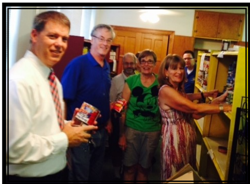
Rotary Club volunteering in the Food Pantry

The Food Ministry that is happening in our basement is truly amazing! The pantry is receiving up to 16 pallets of food from the St. Louis Area Food Bank each week. Good food. This food ministry is reaching over 1,450 people per month now and is in great need of volunteers. This church should be very proud of how it is helping many families to survive and has for a long time helped by donating space and utilities. It uses the whole basement now and has over 40 volunteers from all over St. Louis. It handles over $500,000 worth of food which is distributed 5 days each week of the year. The Rotary, Girl Scouts and folks who work as well as some who are retired or are patrons of the pantry all come to help stock, distribute food, and help when the truck comes on Monday and Friday afternoons. It is a labor of love for this community. We are known by community leaders for this great service.