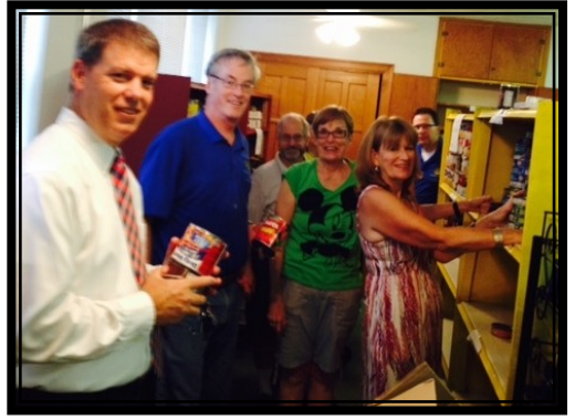
Rotary Club volunteering in the Food Pantry

community leaders for this great service.