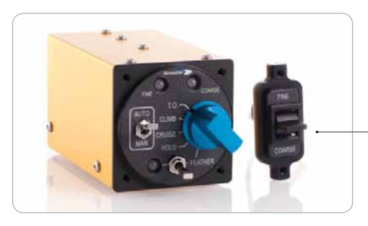
Easy to Operate with simple selection of engine speeds for TakeOff, Climb and Cruise.