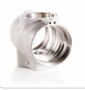
Superior Strength from fully machined, one piece hub.