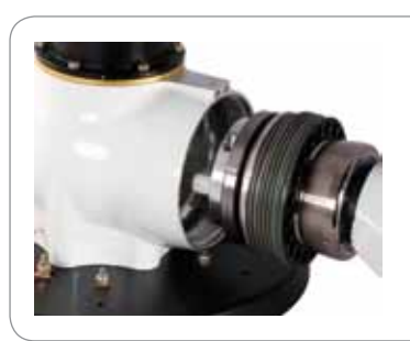
Easy Installation and maintenance due to removable blade cartridge.