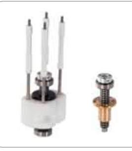
Smooth Operation from 'precision pitch change' mechanism ensuring low backlash and vibration free performance.

Full feathering to reduce drag on stopped engine.