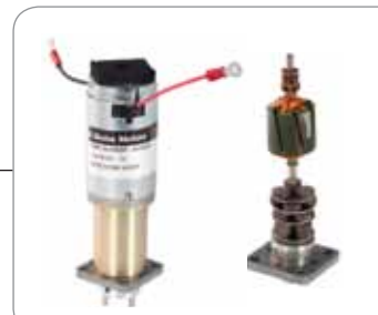
Electric Actuation by quality Globe gearmotor (made in USA).

Each Airmaster propeller is crafted to the specific requirements of your aircraft and engine combination. We supply a full system incorporating CS hub, composite blades, CS governor, spinner, extensions, wiring and hardware.