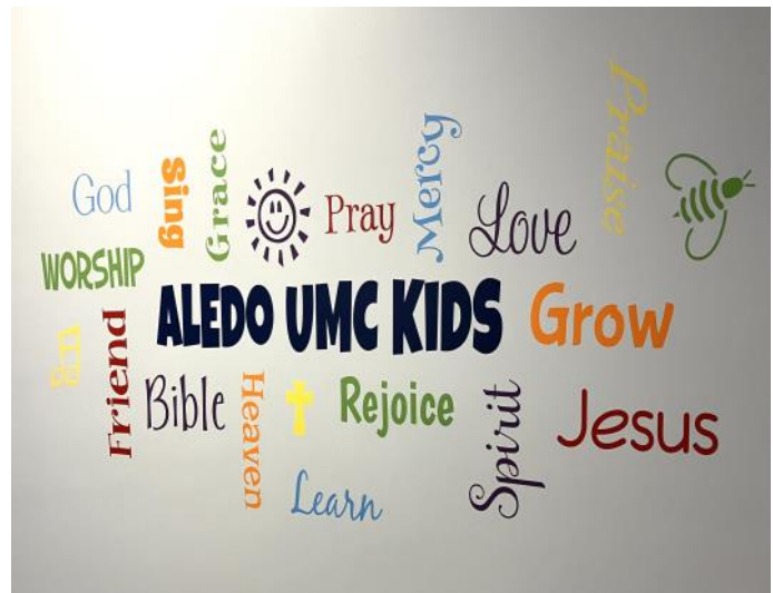
New wall art in the education wing.

We hope we remembered everyone, but if not, we apologize.