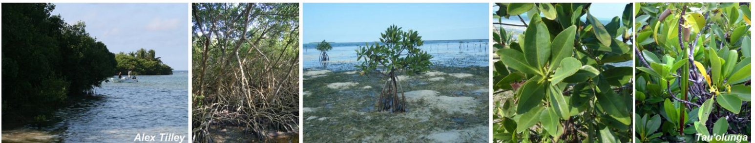
RED MANGROVE Rhizophora mangle