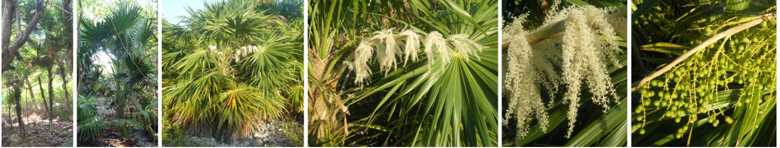
CHIT PALM Thrinax radiata