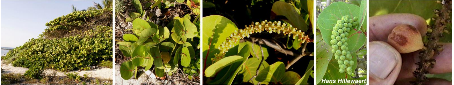
SEA GRAPE Coccoloba uvifera