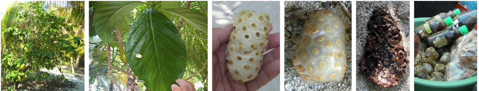
NONI TREE Morinda citrifolia