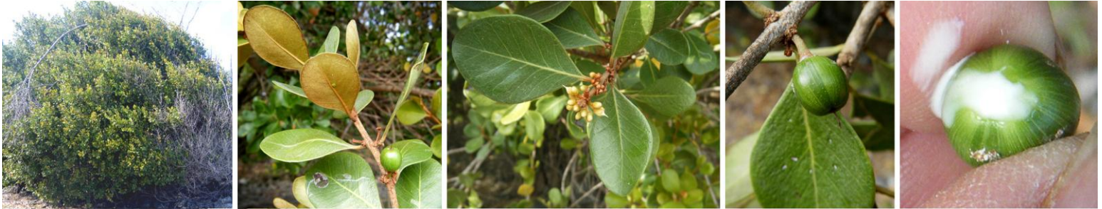
FIG Ficus sp.