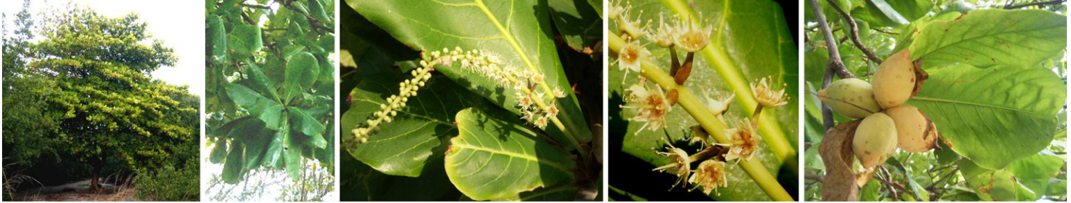
INDIAN ALMOND Terminalia catappa