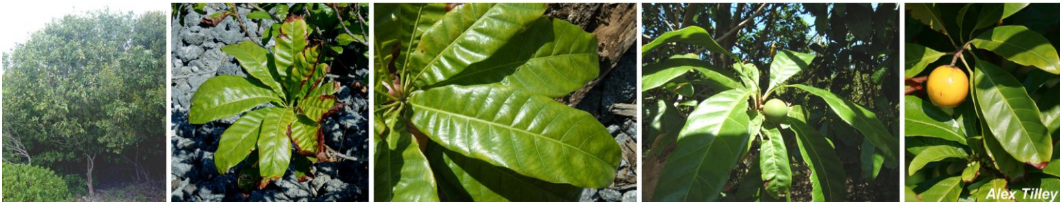
CANISTEL Pouteria campechiana