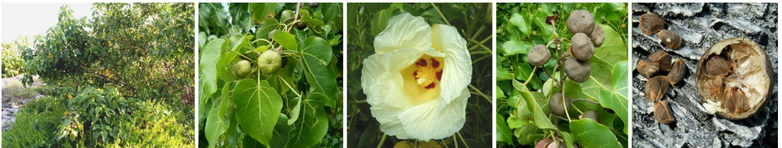
SEASIDE MAHO Thespesia populnea