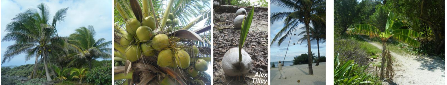
COCONUT PALM Cocos nucifera