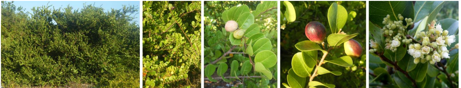
COCO PLUM Chrysobalanus icaco