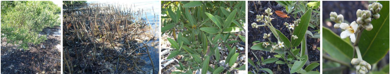
BLACK MANGROVE Avicennia germinans