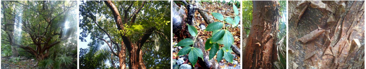
GUMBO LIMBO Bursera simaruba