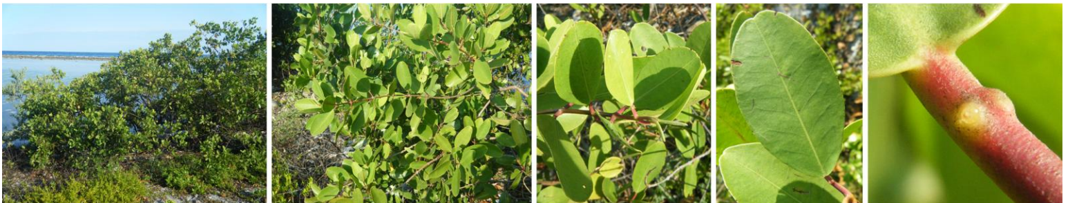
WHITE MANGROVE Laguncularia racemosa