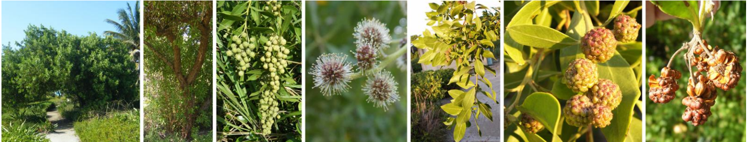
BUTTONWOOD Conocarpus erectus