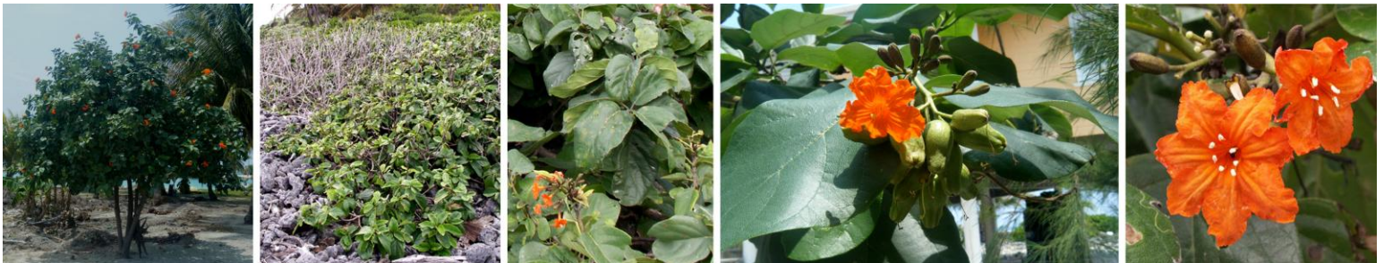
ZIRICOTE Cordia sebestena