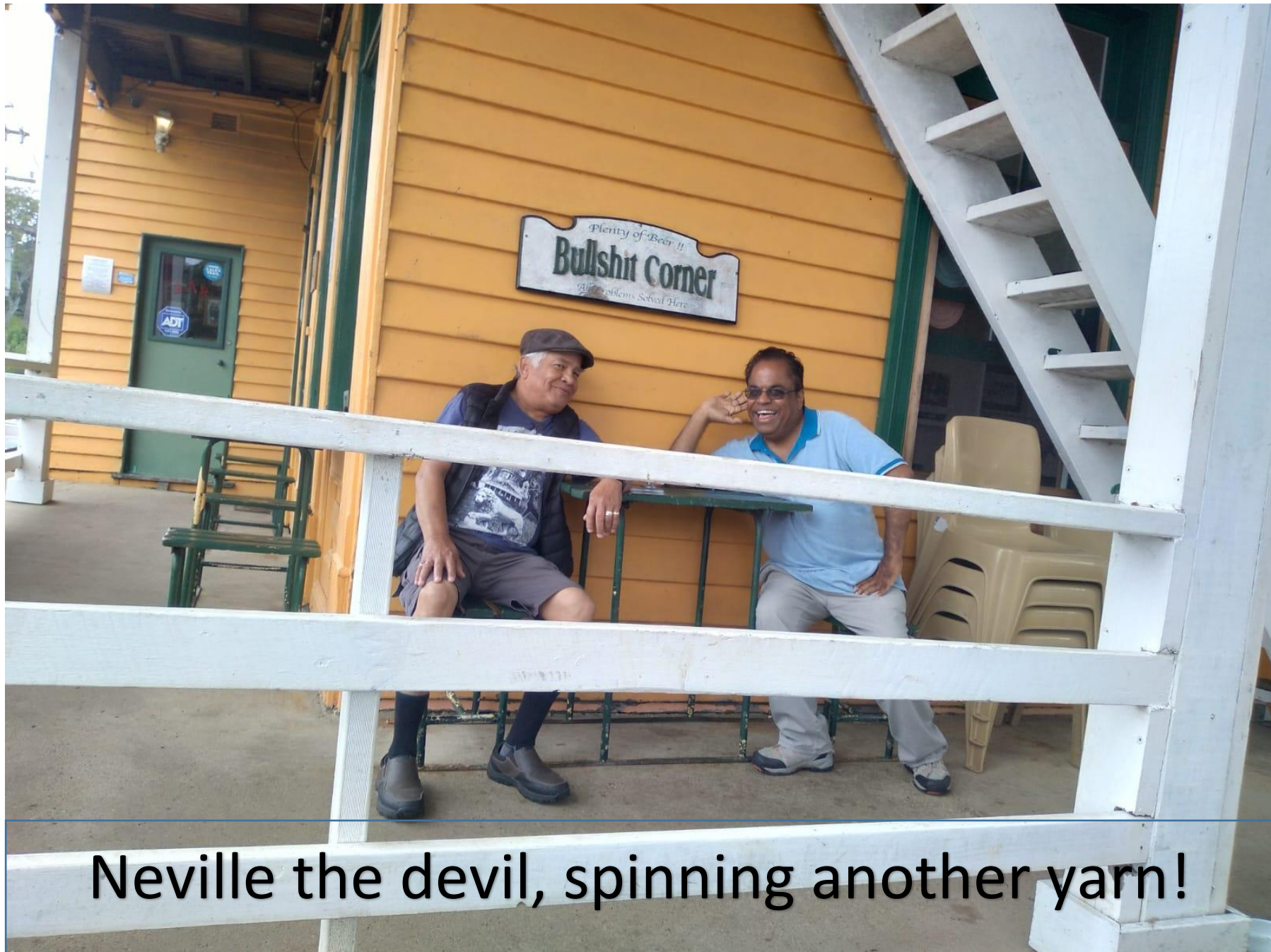
Neville the devil, spinning another yarn!