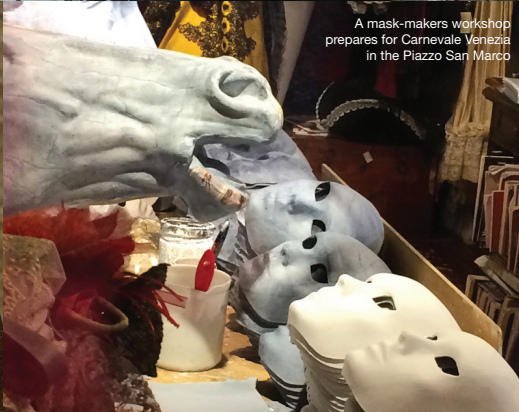
A mask-maker's workshop prepares for Carnevale Venezia in the Piazza San Marco