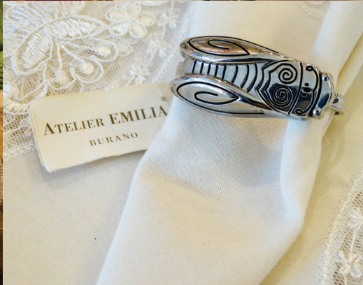
ATELIER EMILIA BURANO