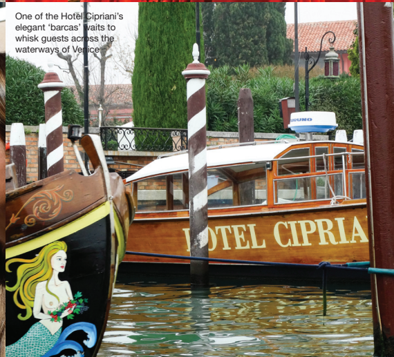
One of the Hotel Cipriani's elegant 'barcas' waits to whisk guests across the waterways of Venice