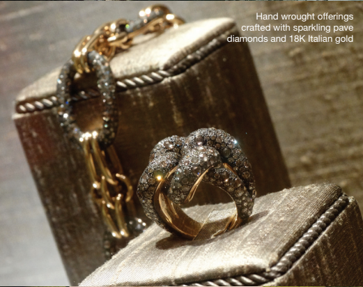
Hand wrought offerings crafted with sparkling pave diamonds and 18K Italian gold