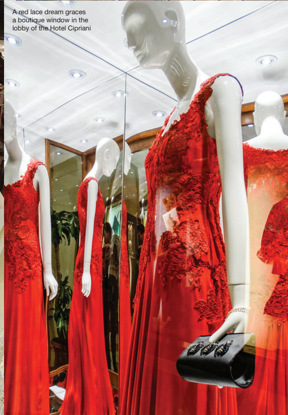
A red lace dream graces a boutique window in the lobby of the Hotel Cipriani