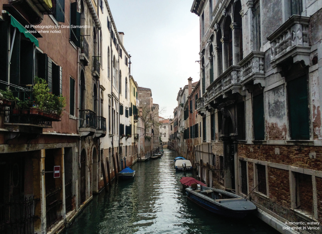
A romantic, watery side street in Venice