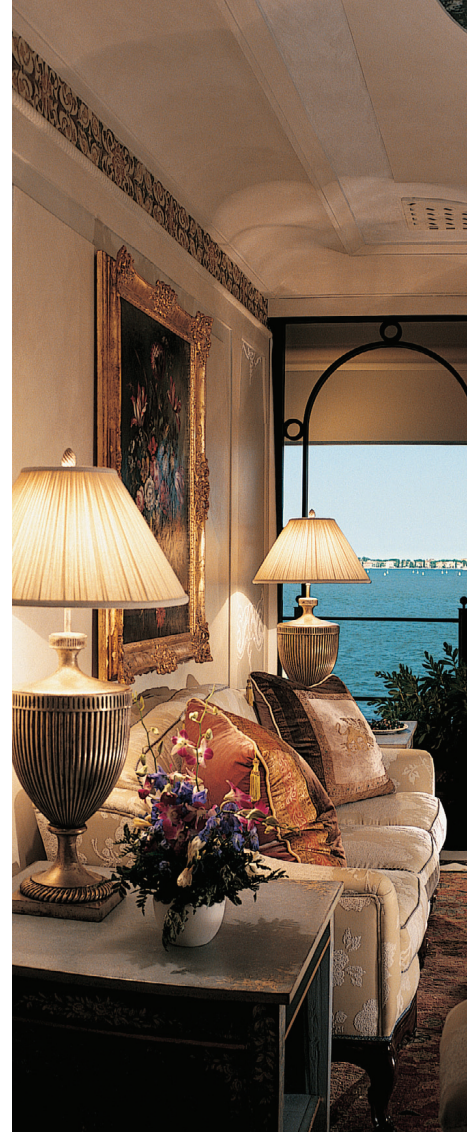
The living room of Cipriani's Palladio Suite where George & Amal Clooney stayed during their wedding week in Venice. It has private terraces, a plunge pool, stunning views of Venice, a private entrance hidden at the rear of the Cipriani's gardens and it's own dock to allow guests privacy from the paparazzi.

Guests arriving to the Cipriani by water taxi as most do, either from Marco Polo airport just a short cruise away or from one of the neighboring Venetian hotels -are greeted at the hotel dock before being led along a garden path to an elegant lobby. Rife with old world charm, you won't find modern card keys at the Cipriani. Rather, upon check-in guests are presented with a weighty, brass fob reminiscent of the grand hotels of yesteryear. Sprawling out from the hotel lobby and spilling outdoors towards the lagoon that surrounds the island is a breathtaking, Italianate landscape where sculpture, fruit trees and flowers all vie for attention. In the gardens guests are invited to stroll, explore or simply relax. On a perfect day one may even catch a glimpse of Roberta, the hotel's resident turtle, sunning herself by a fountain or stumble upon a colony of bunnies nestled in the shade of the rose garden. Indoors, lovely boutiques dot the main level and hallways lead to the hotel's restaurants including the legendary Cip's Club, where guests may dine al fresco against amazing St. Mark's views. Other Cipriani dining options include