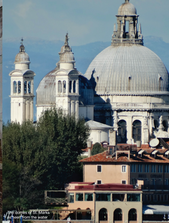
The domes of St. Marks as seen from the water