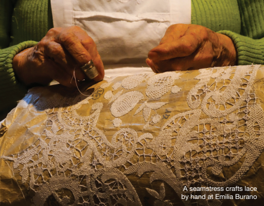
A seamstress crafts lace by hand at Emilia Burano