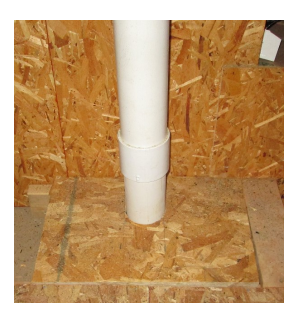
The small piece of OSB was cut to fit and placed before the connecting collar and pipe about the collar was installed.

We chose the roof exhaust instead of a pipe running up along the outside of our house. The fan is not exposed to the elements in the attic. The roof vent is not noticeable on the front of our house.