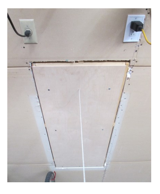
The attic ladder in the closed position - still needs the 5/8 drywall fire barrier to get the garage ceiling up to code

The attic ladder hole was cut in the ceiling by enlarging the scuttle hole. The new size is 22 1/2" by 54". On a Saturday morning, a family of Girl Scouts and Boy Scouts (the family that helps out at the February train show) came over to help with the attic ladder installation.