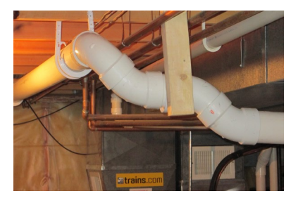
The PVC elbow configuration allows the exhaust pipe to go under the heat ducts and water pipes.

On the day of installation, Lance and his wife arrived about 12:30 pm for the installation process.