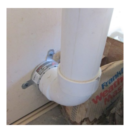
Elbow joint from the basement ceiling joist into the garage. Note the fire stop collar.

Special 'fire stop' brackets were used to mount the exhaust pipe to the garage wall and ceiling.