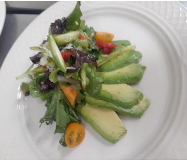
Dish Name: Tomato & Avocado Salad Description: Mixed greens, asparagus, cucumber, Champagne Vinaigrette