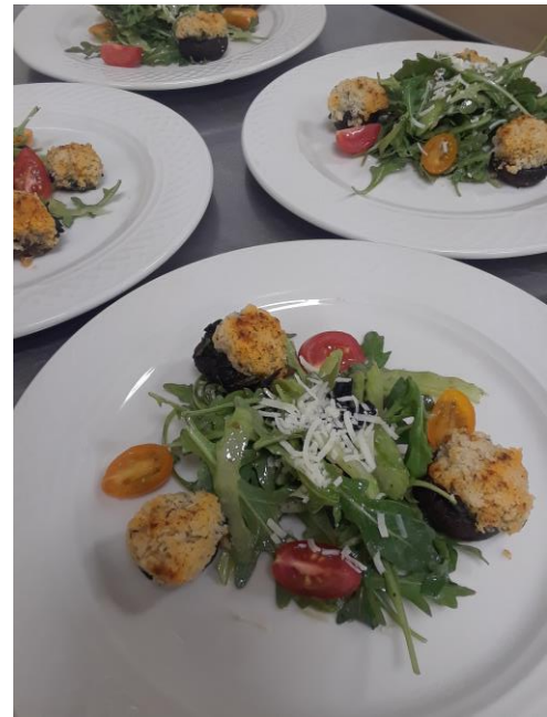
Dish Name: Stuffed Mushroom Description: spinach & garlic stuffed mushrooms, mixed greens vinaigrette dressing