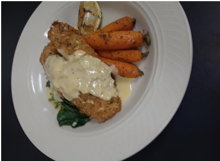
Dish Name: Almond Crusted Tilapia Description: Garlic Sautéed Spinach, roasted baby carrots, herbs butter sauce