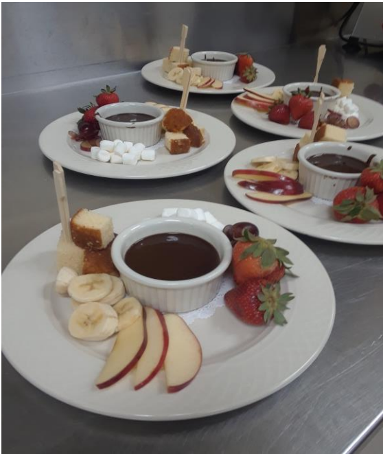
Dish Name: Pots of Chocolate Fondue Description: Poundcake, bananas, strawberries, marshmallows, grapes