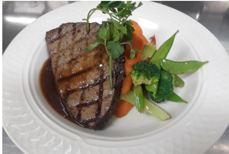
Dish Name: Herb Marinated Top Ranch Steak Description: Roasted baby carrots, spinach, vegetables