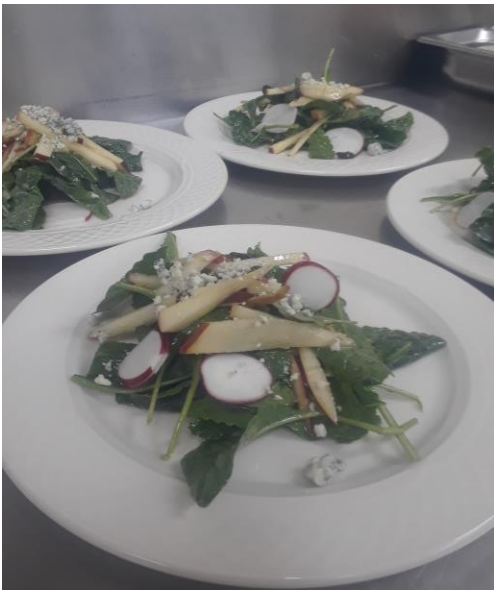
Dish Name: Apple & Kale Salad Description: Crumbled Blue Cheese, Apple Cider Vinaigrette