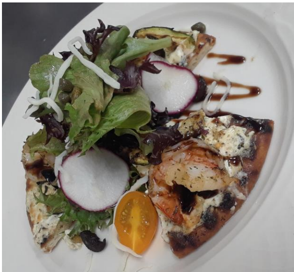
Dish Name: Grilled Shrimp Flatbread, Description: mixed greens, herb goat Cheese balsamic glaze