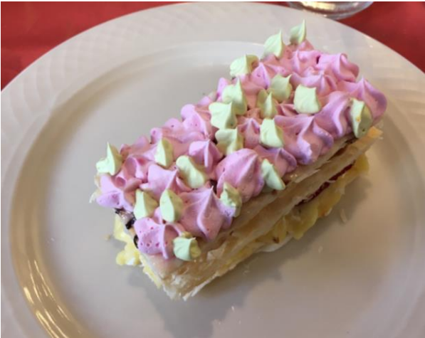
Dish Name: Napolen Description: Pastry Cream Thousand sheets sweet merengue