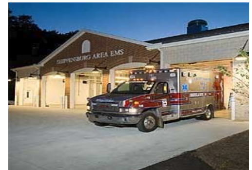
Our volunteer and career staff stand ready. Night or day we are committed to your safety.