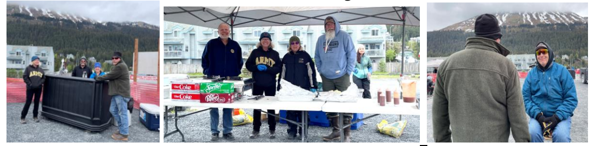
Cemetery Prep, Memorial Day, 22 Minute Salute