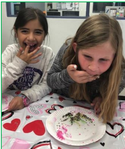
Boys & Girls Club kids enjoying the leftovers after decorating Valentine's cookies.