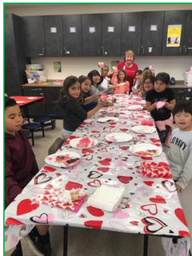
First graders at Boys & Girls Club ready to decorate cookies.