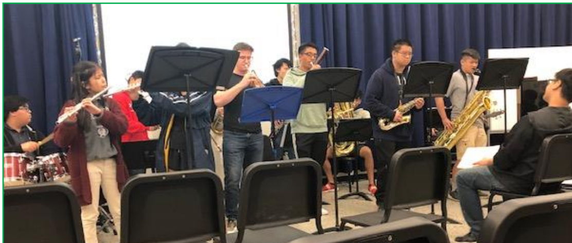
Oxford Academy band performing musical creations by women.