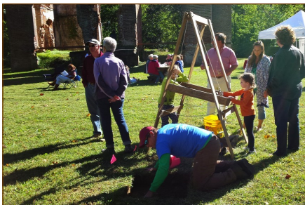
Kids of all ages will enjoy the archeological activities, coordinated by The Fairfield Foundation.

Guided tours of the Ruins are included with your BBQ ticket! Archeological activities will be coordinated by the dynamic duo of