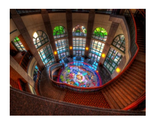
Atrium - Bob Bullock Museum - 27 Pete Holland