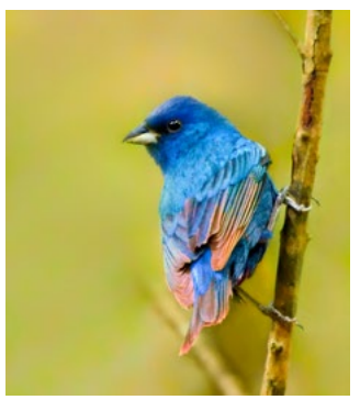
Blue Grosbeak - 26 Nancy Naylor