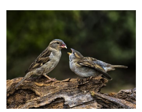
Feed the Baby - 27 Paul Munch