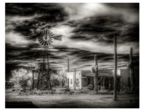
Quartzsite Arizona - 27 Pete Holland