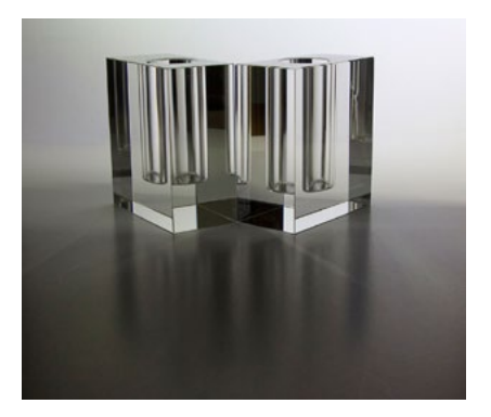
Practice after Lighting Class - 27 Lois Schubert