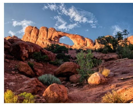
Skyline Arch