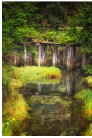
Forgotten - 27 Cheryl Callen