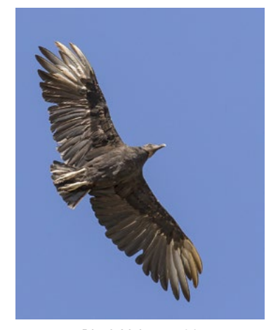
Black Vulture - 26 Kathy McCall