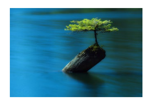
Fairy Lake - 27 Cheryl Callen