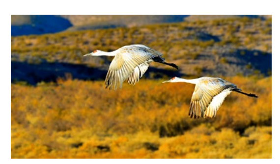
Sandhill Cranes - 27 Phil Charlton