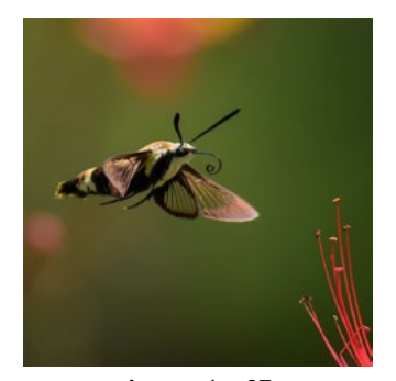
Approach - 27 Linda Sheppard