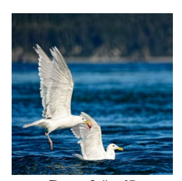
Thayers Gulls - 27 Phil Charlton