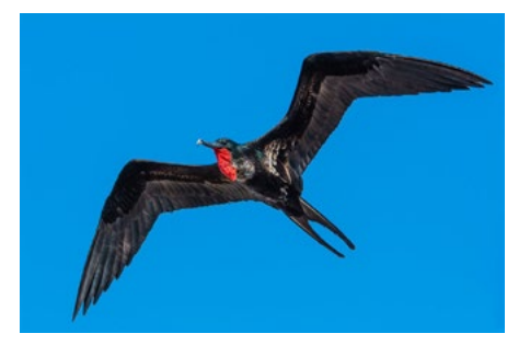
Male Frigate Bird - 27 Dolph McCranie