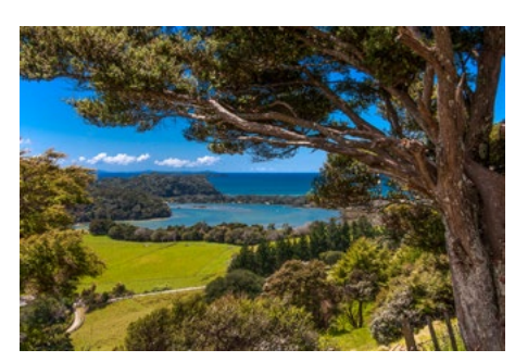
Ocean View in New Zealand - 27 Richard Bennett