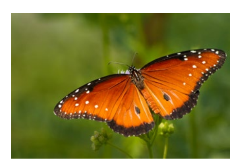
Queen Butterfly - 27 Linda Avitt