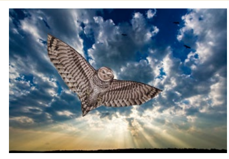
It's Just A Kite - 27 Kushal Bose