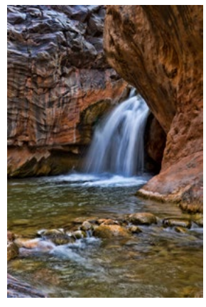
Grand Canyon Waterfall - 27 Lois Schubert