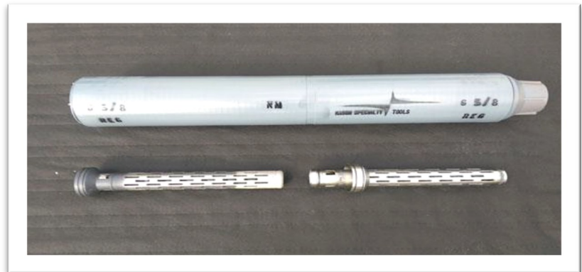
Mason Specialty Tools-Downhole Filter Sub

We offer Filter Subs in all sizes and connections as well as in Non-Magnetic and Steel, giving you the ability to place in multiple locations in the BHA or above. While designing our filter subs we conducted expert engineering and metallurgy studies and kept in mind the total flow area around and through the filter, which allows our customer to pump at maximum flow rates without the worry of erosion. Due to the engineering of the filter's creatively designed port holes, we have also significantly reduced the possibility of total plug up.