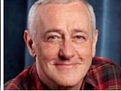
30 Gay Actors Famous for Playing Straight Characters