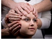
If you don't speak Spanish, watch this video now