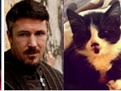
23 Cats Who Look Like Game of Thrones Characters