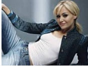
20 celebrities we didn't know were gay before they came out.