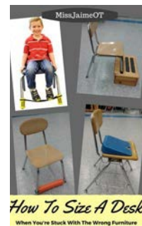
How To Size A Desk When You're Stuck With The Wrong Furniture

The Crucial Importance Of Positioning In The Classroom This post is part of a 12-month series called Functional Skills for Kids written by pediatric OTs and PTs to post on different developmental topics that impact functional skills for kids.