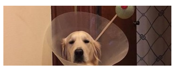
17 Dogs Ashamed Of Their Humans