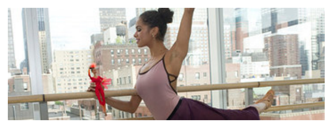
Misty Copeland Is Now A Barbie And People Are Super Excited