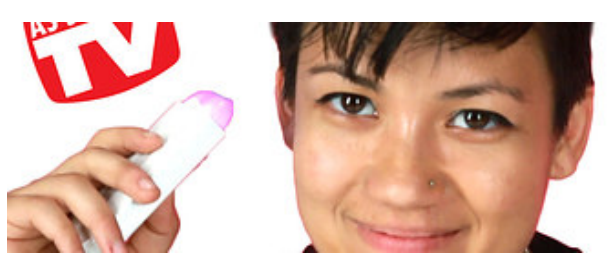
We Tried "As Seen On TV" Hair-Removal Products And Things Got Interesting