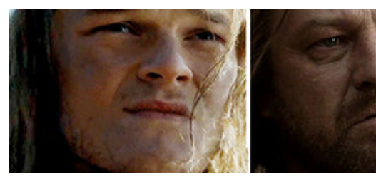
It Looks Like "Game Of Thrones" Will Finally Confirm This Fan Theory Next Week