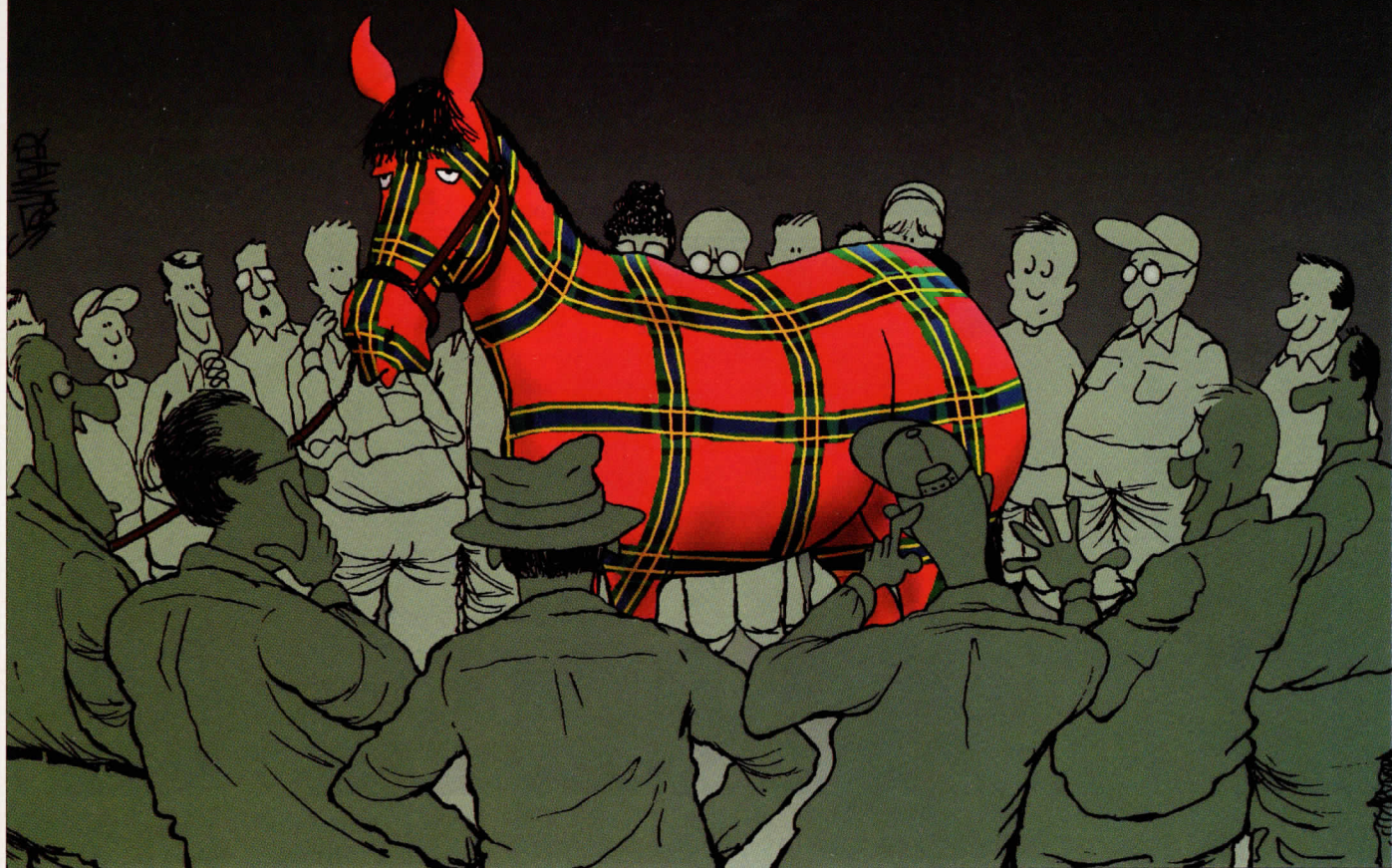
Clayton Strohmeier illustration