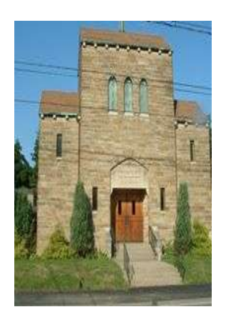
Can you help? Can you spare an hour or two?

Is this a project... – just right for you?