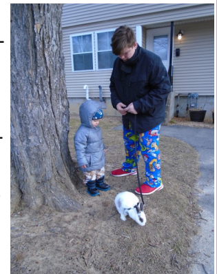
Nice Day for a Bunny Hop