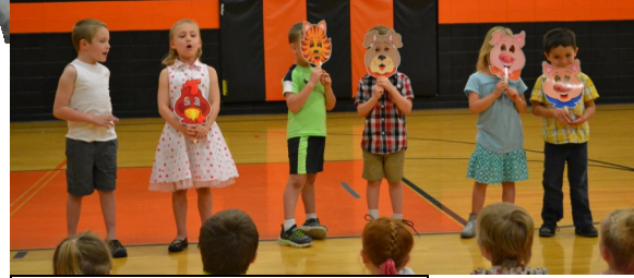
PK Spring Program