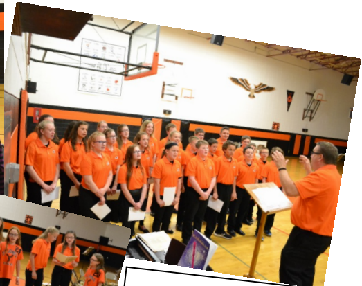
Gr. 5 Civil War Night