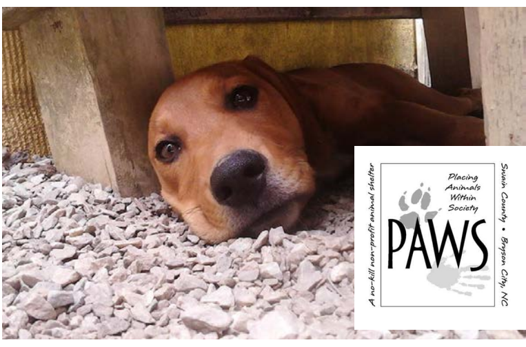
PAWS is a 501(c)3 non-profit, no-kill animal shelter existing on the generosity of private donors.