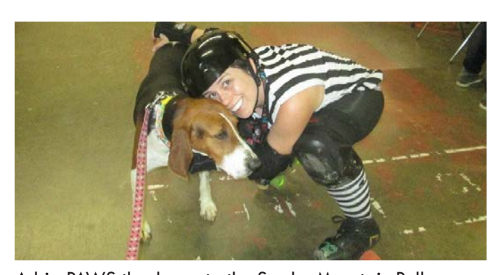
A big PAWS thank you to the Smoky Mountain Roller Girls. On March 21, the group hosted a bout in which they donated 50% of their ticket sales to PAWS They also collected dog and cat food, along with other items on PAWS wish list at the door.