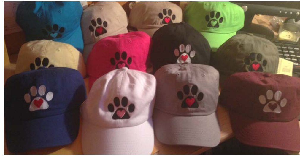
We have PAWS T-shirts and ball caps for sale. Buy yours at any of our events or at PAWS Thrift Store. They make great gifts!