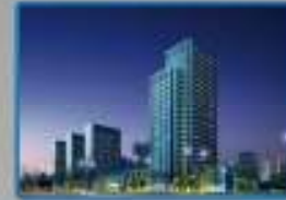
Networked Security: Building