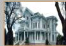
Standalone Access Control: House