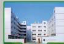
Time Attendance: Factory