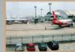
Standalone Access Control: Airport