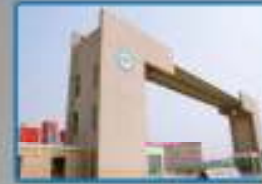
Networked Security: School