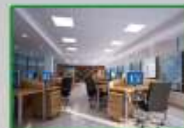
Time Attendance: Office