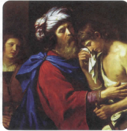
RETURN OF THE PRODIGAL SON, GUERCINO

Why did Jesus always speak in parables? Why didn't he give us clearer answers?