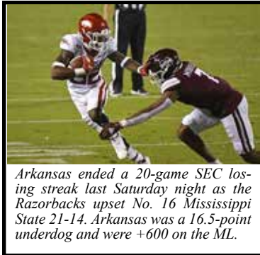
Arkansas ended a 20-game SEC losing streak last Saturday night as the Razorbacks upset No. 16 Mississippi State 21-14. Arkansas was a 16.5-point underdog and were +600 on the ML.