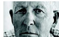
'Warren Buffett Indicator' Signals Co... Moneynews