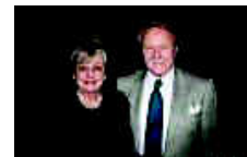
Acanthus Society cocktail reception