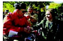
Veterans Day Parade in Franklin