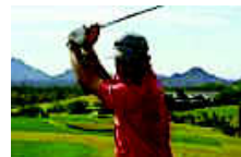
10 classic golf frustrations amateur... Hank Haney University