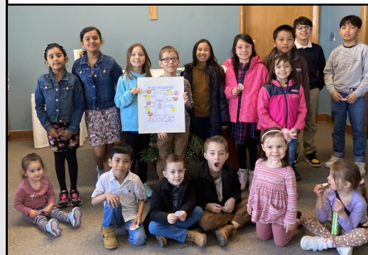
CHILDREN'S LITURGY APRIL 28 TH

MAY 5 - THE POPE'S PASTORAL WORKS: When a disastrous flood or earthquake strikes a nation in some part of the world, many countries rush in food, medicine, blankets, money, and trained people. Prominent among such aid is the financial help offered by the Holy Father to people in need. In the name of Catholics everywhere, he