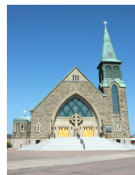
Saint Augustine's 340 Dominion Street Moncton, NB