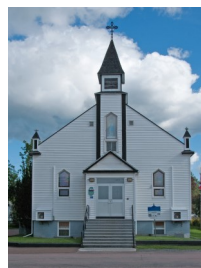
Our Lady of Mercy 11 St. Andrews Street Pointe-du-Chêne, NB