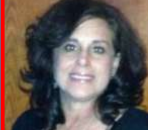
Please introduce yourself next time you see us and share your ideas for making this club even more amazing in 2014!!!