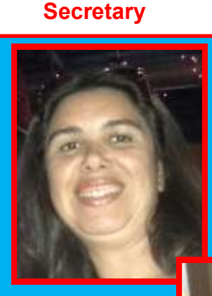
We're looking to have a great 2014 and hope that you all will join us.