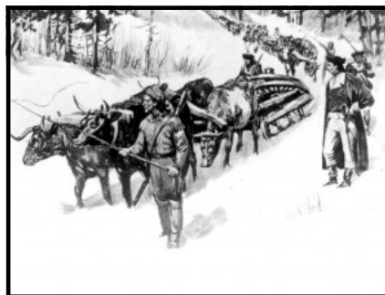
Hauling Guns from Ft. Ticonderoga (US Archives 111-SC-100815)

Admission to the "The Noble Train Begins" event is $10 per person and payable at the gate. Friends of Fort Ticonderoga and children 4 years and under are free. For more details visit <www.fortticonderoga.org> or call 518-585-2821.