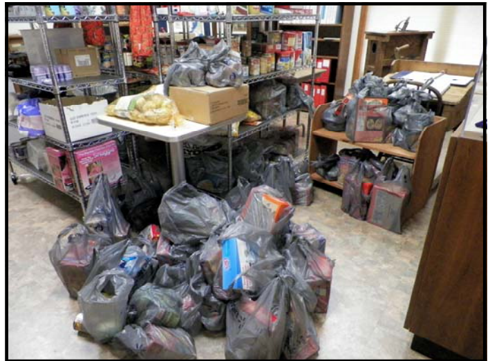
Bags in the Hague Food Pantry donated by the Scouts

The Hague Boy Scouts and Cub Scouts collected food for the Hague and Ticonderoga food pantries during the "Scouting for Food" program. The community was very generous with their donations and seven grocery carts packed full of food were collected at Walmart on November 9, 2014.