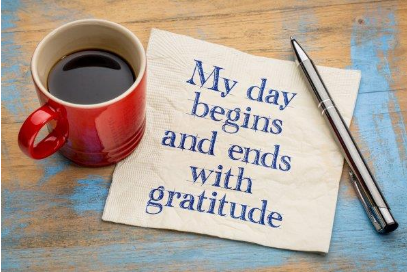
March's Gratitude

committees. Each segment contains a suggested scripture, hymn ideas, a reflection or implication for GLI advocacy, and an action idea. The guide also includes action suggestions.