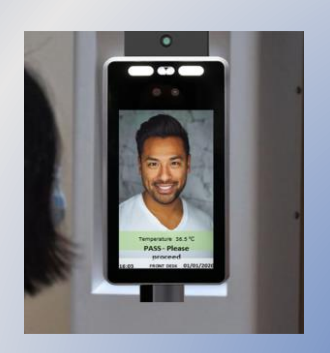
Realtime temperature checks: < .05 secs