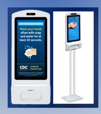
Sanitization & Health Promotion