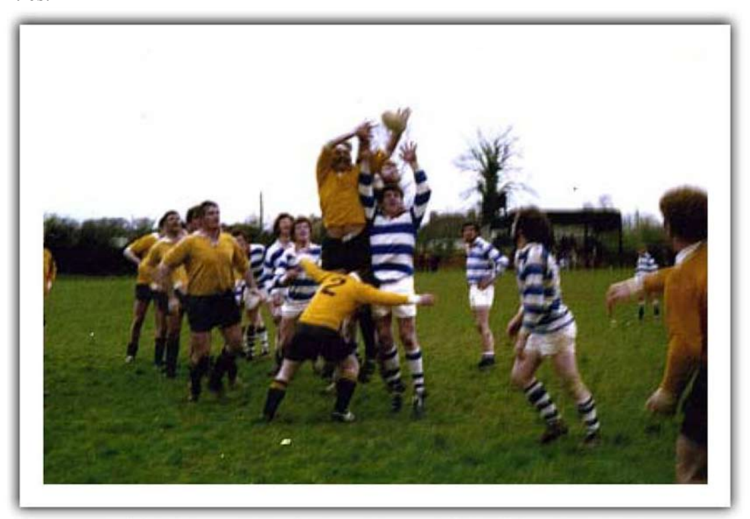
Curragh V Athy 2nds - Towns Cup Final Tullamore 1977

Close ties have continue with the Defence Forces. The GoC is the club Patron and has kindly allowed the Club to play some matches at the Green Road, Curragh grounds including the use the Sports Centre dressing room facilities.