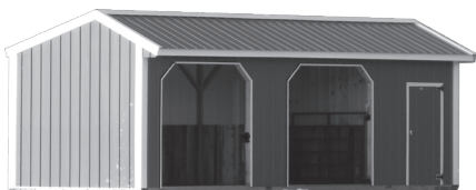
Deluxe Tackroom Barns