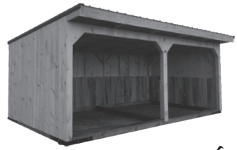
Economy Run-In Sheds