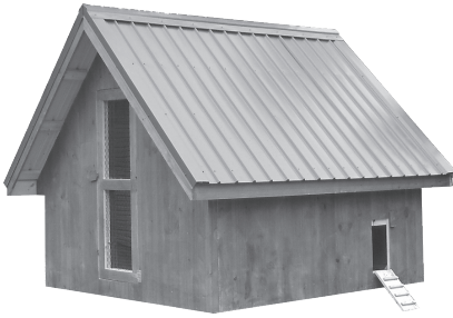
Walk-In Chicken Coops