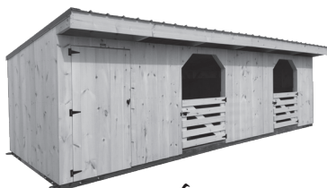
Economy Tackroom Barns