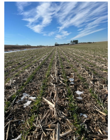
No till and Cover crops

There are financial assistance programs available for your conservation projects with varying cost share rates. For more information: visit our office, call (563) 547-3040 ext. #3, or go to www.nrcs.usda.gov or www.howardswcd.org