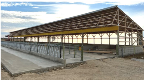
Ag waste system