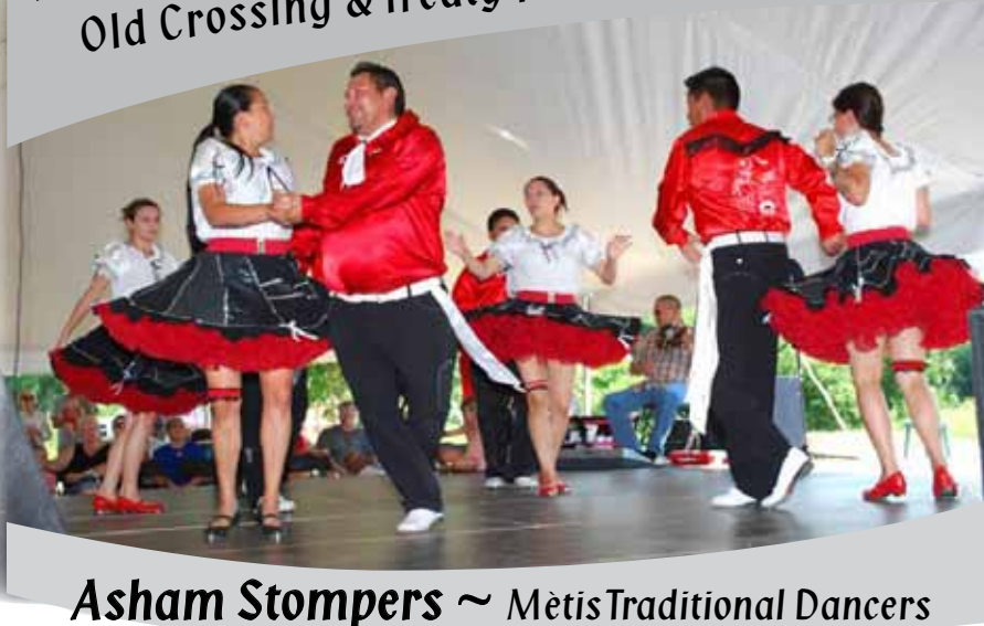
Asham Stompers ~ Métis Traditional Dancers

August 25, 26 & 27, 2017 Old Crossing & Treaty Park, Huot, MN